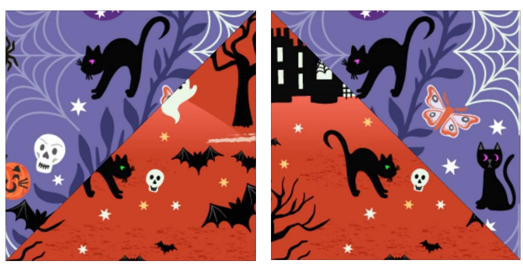
4½" x 4½" square.

Lay out your triangle fabric pieces as in the main diagram. Take two triangle pieces and sew them together to make a square, press and then trim to a